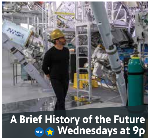
A Brief History of the Future Wednesdays at 9p