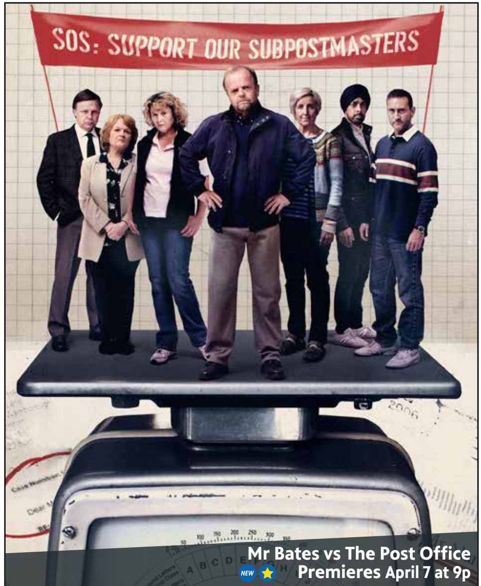
Mr Bates vs The Post Office Premieres April 7 at 9p

Timed to air the week of Earth Day, we go back to the 1970s for Poisoned Ground: The Tragedy at Love Canal from American Experience . The documentary delves into the